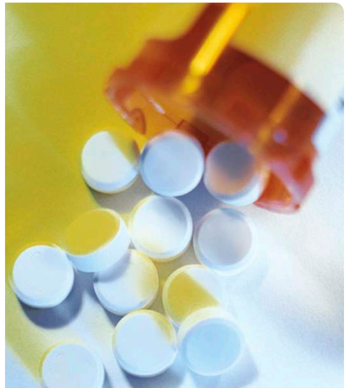
If you have AFib, your doctor may prescribe medications to help prevent clots from forming in your arteries.